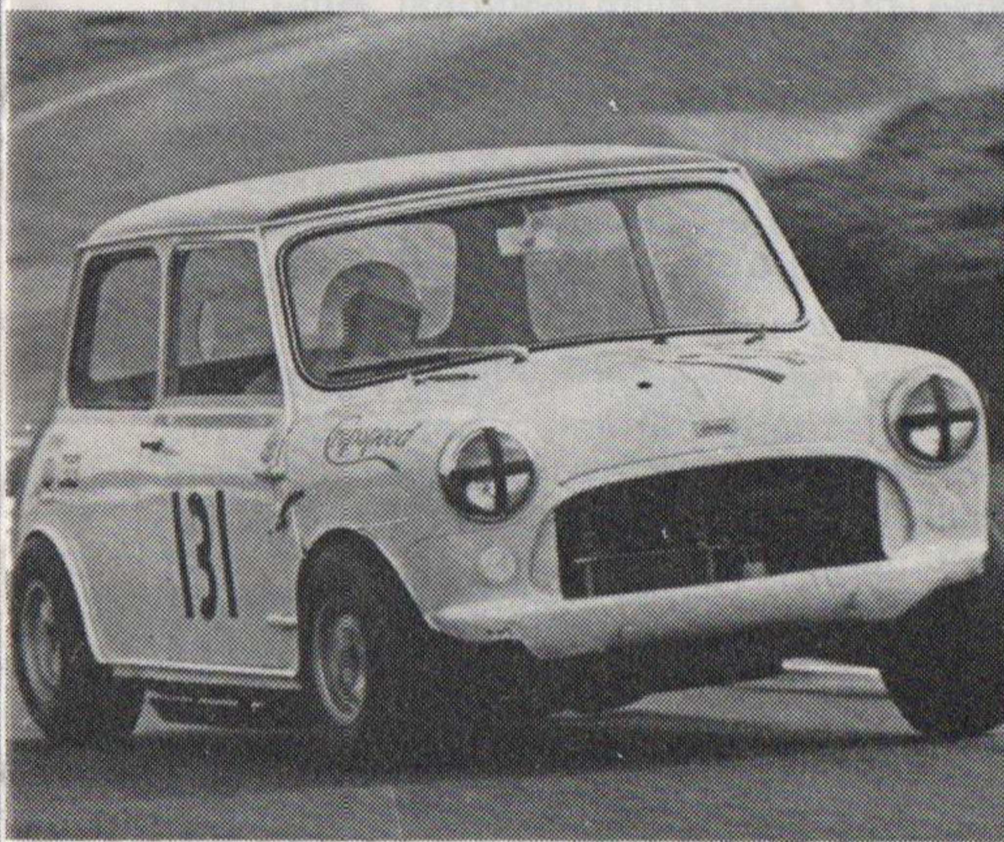
Single Seaters, Saloons, Sports Cars, a sheer feast of racing cars can be seen here at Snetterton today. Far left , cheapest and sometimes the most evenly matched racing around is without doubt Formula Ford. Left and above , with the Redex Championship for Saloon Cars hotting up, today's round should prove very entertaining.